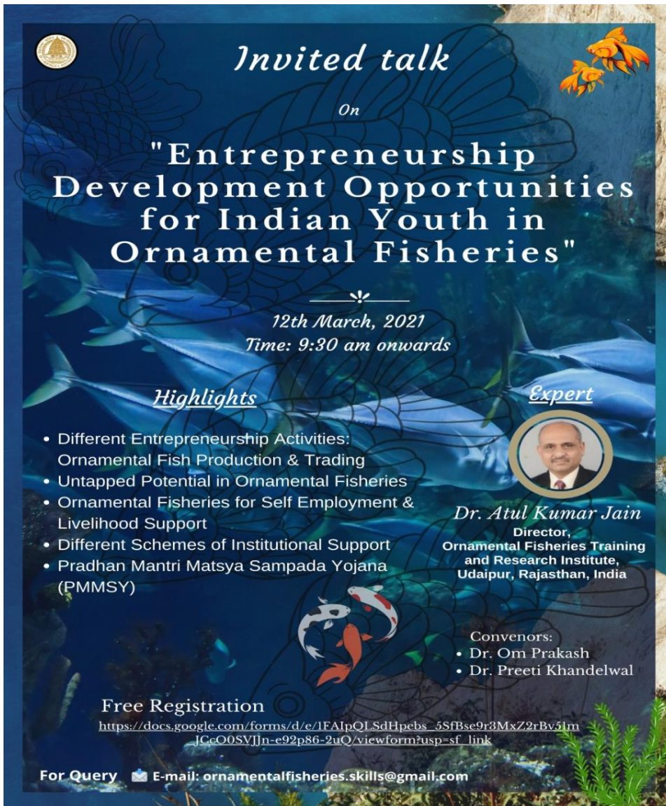
Poster for invited talk